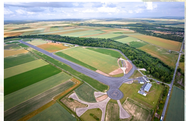
Figure 1: Juvincourt-et-Damary test track

Our workshops, offices and meeting rooms are fully equipped and at your disposal for preparation, analysis and presentation of your tests.