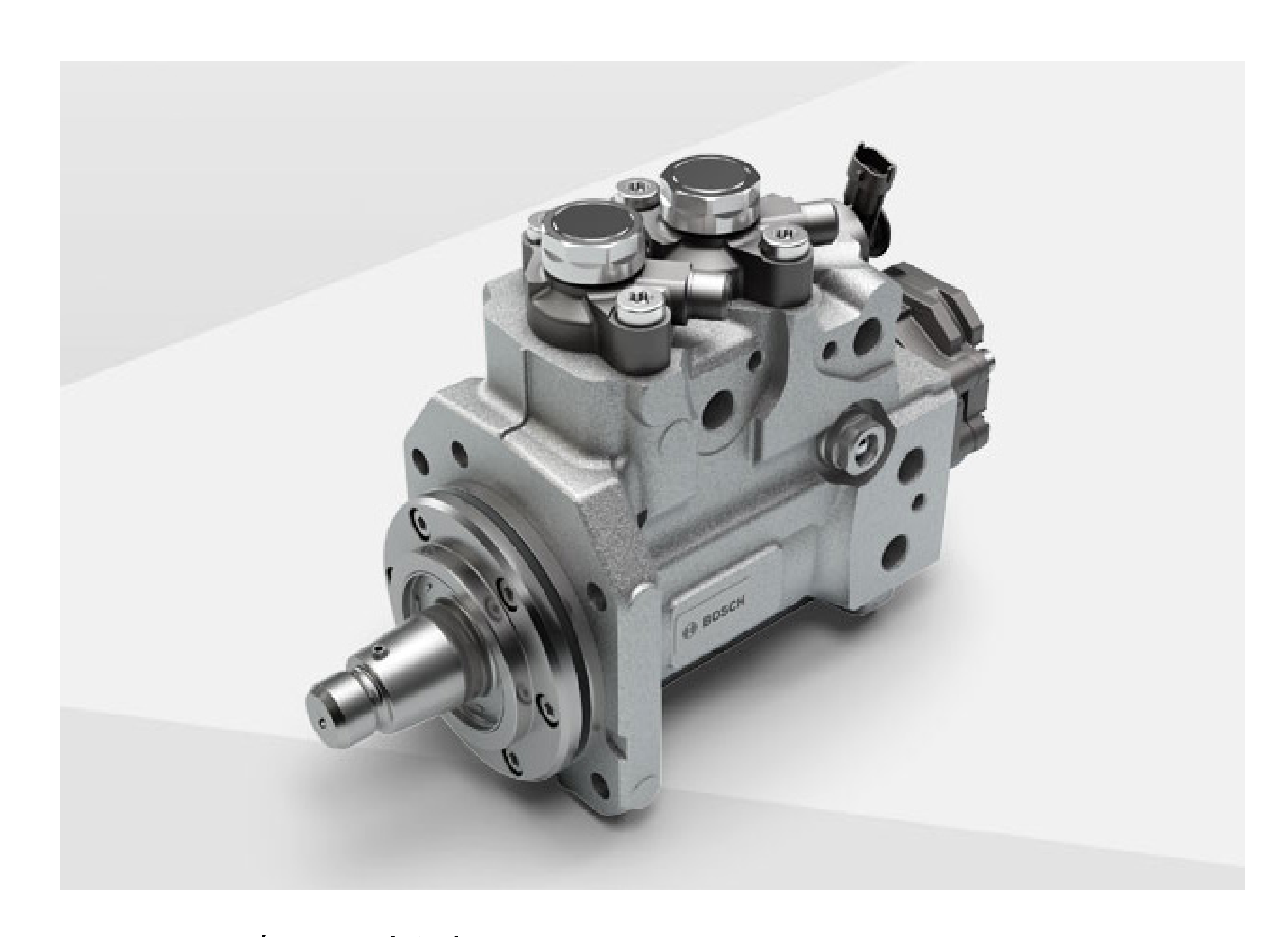
CPN6-25/2 GP high-pressure pump with fuel pre-feed pump