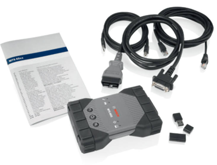
MTS 6531 with P2P Wi-Fi: kit contents

The MTS 6531 VCI input voltage range is from 7 to 32 volts. The MTS 6531 supports 24-volt systems used in light and heavy trucks.